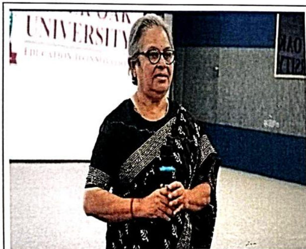
Picture 1. Glimpse of Expert taking session at Event "Fostering Respect: Anti-Ragging Awareness and Prevention" held on 05.10.2023 at Silver Oak University