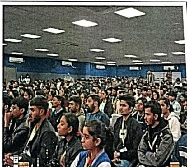
Picture 2. Glimpse of students attending session at Event "Breaking the Chains: Drug Awareness and Prevention" held on 12.03.2024 at Silver Oak University

Established by Gujarat Private Universities Act 2009