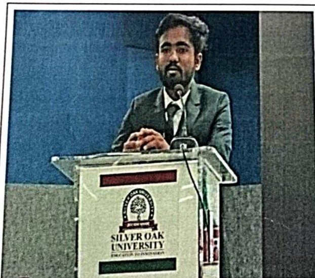
Picture 1. Glimpse of Expert taking session at Event "Breaking the Chains: Drug Awareness and Prevention" held on 12.03.2024 at Silver Oak University