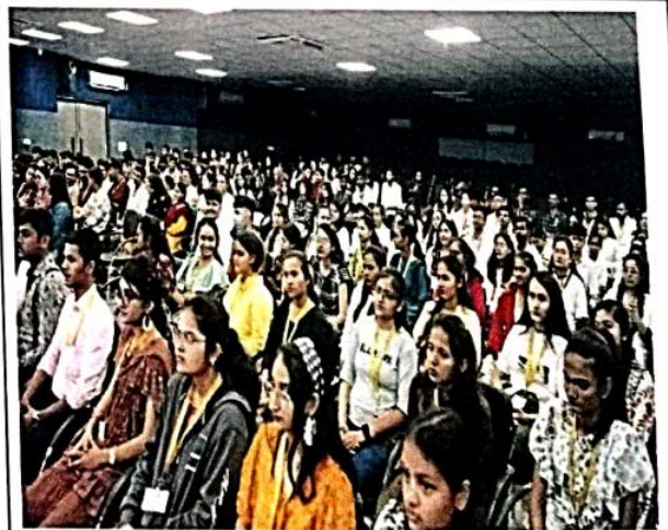
Picture 2. Glimpse of students attending session at Event "Fostering Respect: Anti-Ragging Awareness and Prevention" held on 05.10.2023 at Silver Oak University

Established by Gujarat Private Universities Act 2009